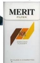
Merit light $22.4