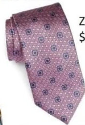
Zegna silk tie $210