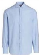
blue Oxford shirt Brunello Cucinelli $430

69% annualized average return (before fees) over 34 years