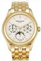
Patek Philippe 5136 $40,000